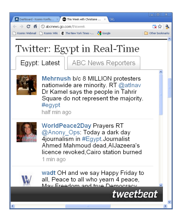
Figure 3: Event monitoring in social media using Tweetbeat

Event Monitoring in the Twittersphere: In late 2010 Kosmix built a flagship application called Tweetbeat that monitors the Twittersphere to detect interesting emerging events (e.g., Egyptian uprising, stock crash, Japanese earthquake), then displays all tweets of these events in real time.